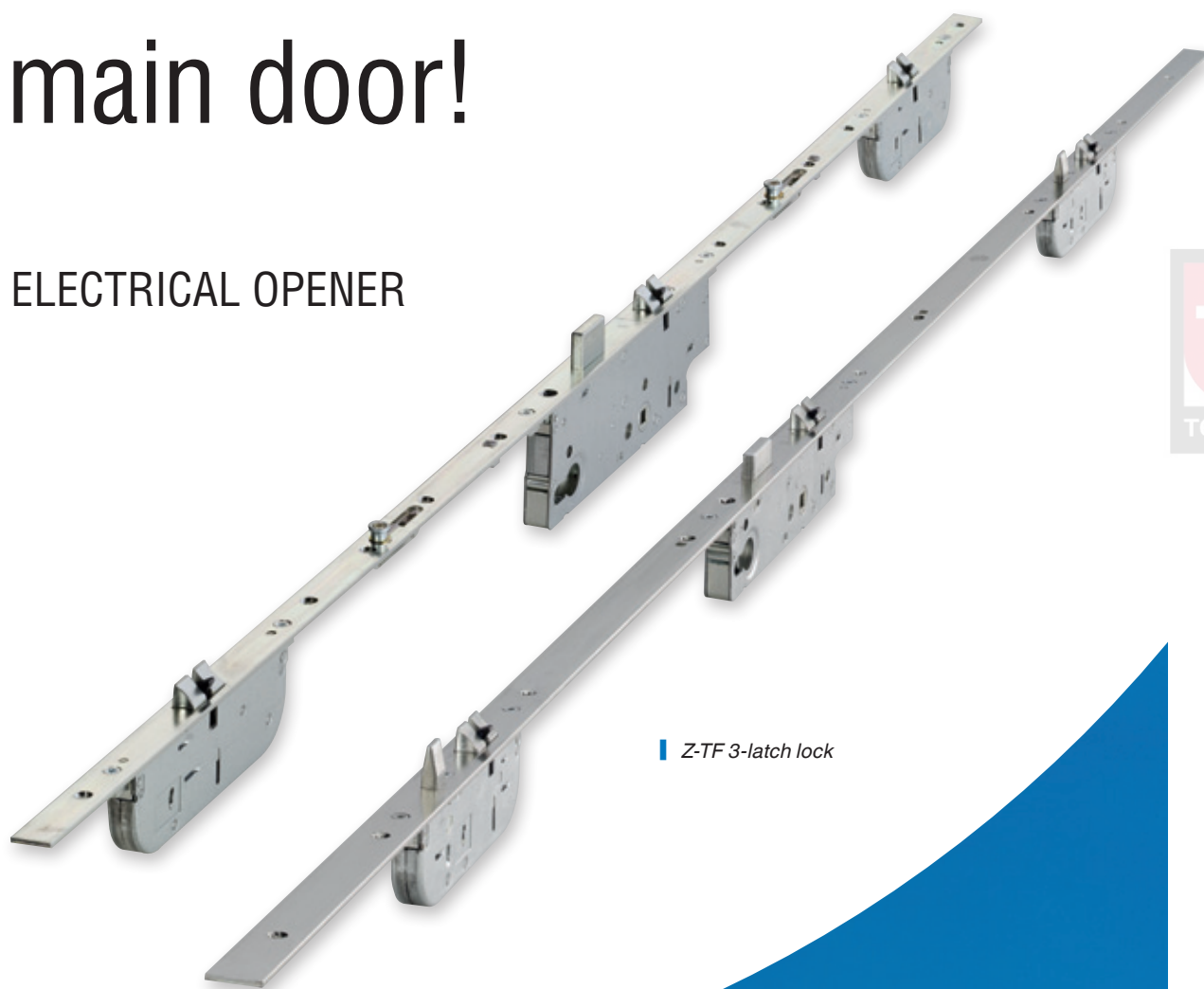
Z-TF 3-latch lock

Simply press a button to open the main door conveniently from any flat. This is one of the main advantages of PROTECT Z-TF when combined with commercially-available, symmetrical electrical openers. No matter how many flats the new building or renovated premises may have.