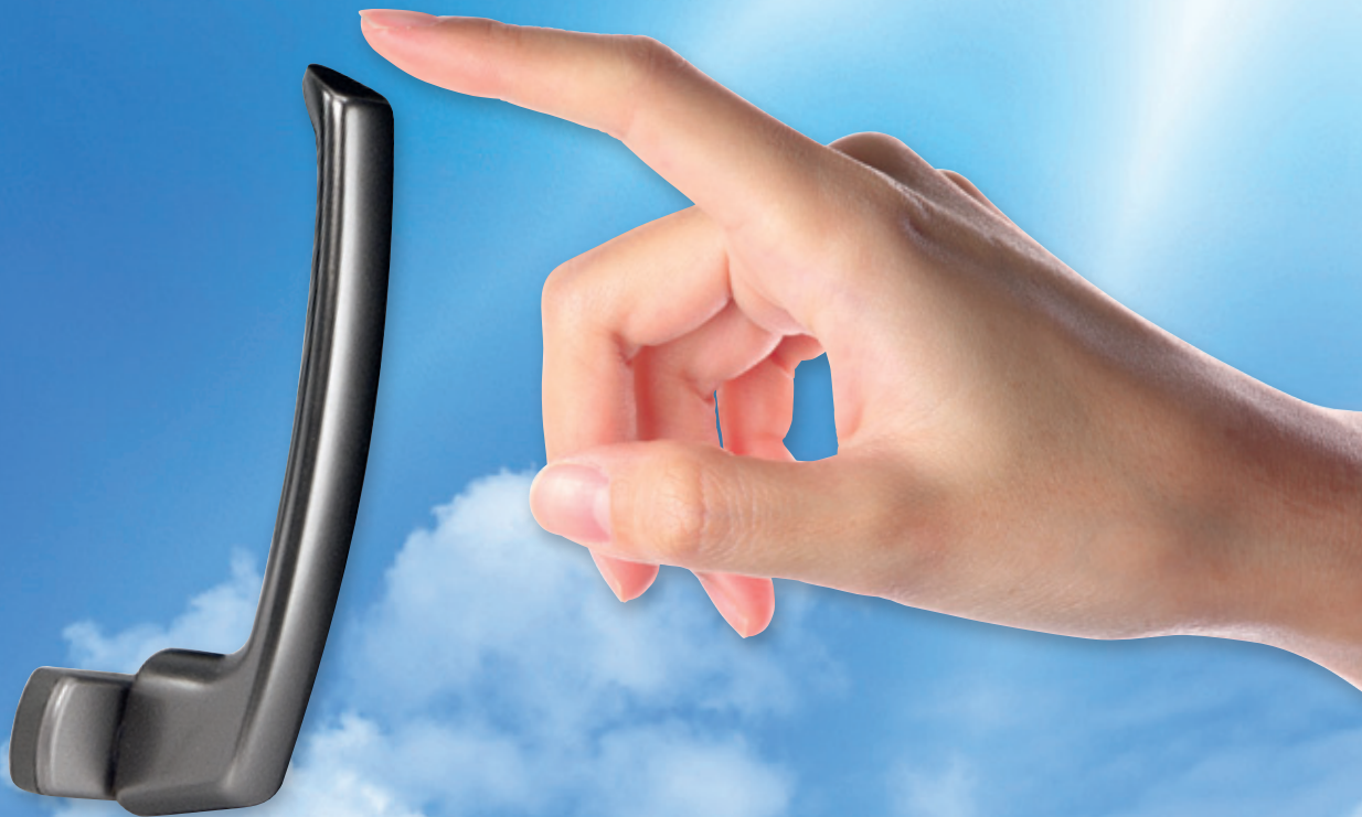
| The MACO SKB handle

IF YOU WANT FIND OUT MORE ABOUT ANY OF THE FITTINGS SOLUTIONS IN THIS BROCHURE, PLEASE CONTACT YOUR MACO TECHNICAL CONSULTANT OR SEND US AN E-MAIL TO PRESSE@MACO.AT .